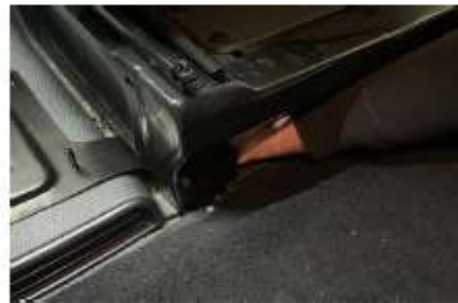
Use black screw 2x to mount bracket DO NOT TIGHTEN YET