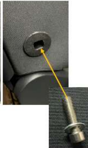
Flip out the cover from armrest remove armrest from seats cover up with special cover and tighten with screw