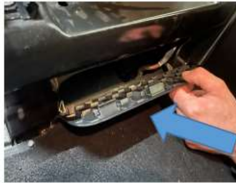
Remove cover on backside of seats